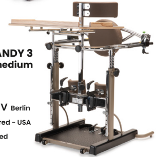
STANDY 3 medium

Tested by TÜV Berlin FDA registered - USA CE marked