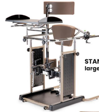
STANDY 4 large